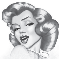
Marilyn Munroe. Died at 36.

Millions know what it is to be paralyzed by a tormenting fear. It drives them to insanity, to drink, and it even drives many to suicide to escape its torment. If you are so unwise to leave yourself without faith in Jesus, you will not be able to stand against it. The Bible calls death “the King of Terrors,” and I have seen it terrorize one man who rejected God. It is fear-