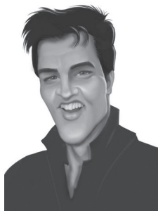
Elvis Presley. Died at 42.

However, if I choose not to believe what I am shown about the computer system, the cables, the inspections, etc., I will be left to be plagued with my fears. My trust in the elevator is a choice, based on knowledge that is simply believed. Re-