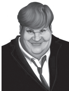
Chris Farley. Died at 33.

The more the Christian trusts the promises of God, the less fear he has. The two are incompati-