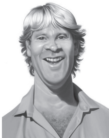
Steve Irwin. Died at 44.

ful to see, but much, much worse to experience.