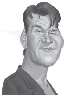
Patrick Swayze. Died at 57.

These depressing things happen to everyone, despite regular exercise, daily juicing, vitamins, and consuming a careful diet. No one can beat this rap. I knew that all this and much more would come in 20 years or so, if death didn't come to me first through a heart attack or aneurysm or a 101 other unexpected surprises.