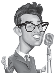
Buddy Holly. Died at 23.

So when it comes to the issue of God and salvation, the die hard skeptic disqualifies himself before he even begins. By choice, he refuses to intellectually believe that God exists, despite the overwhelming and axiomatic evidence of creation and the moral nature of the God-given conscience.