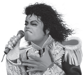
Michael Jackson. Died at 50.

sure they never thought for a moment that two of them wouldn't even get to 64. The presumptuous "when" never came. One went quickly with a bullet, the other slowly with cancer.