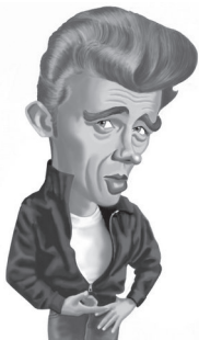
James Dean. Died at 24.

To receive the gift of eternal life, again, you must repent of your sins (turn from them), and put on the Lord Jesus Christ as you would put on a parachute—trusting in Him alone for your salvation. That means you forsake your own good works as a means of trying to please God (trying to bribe Him), and trust